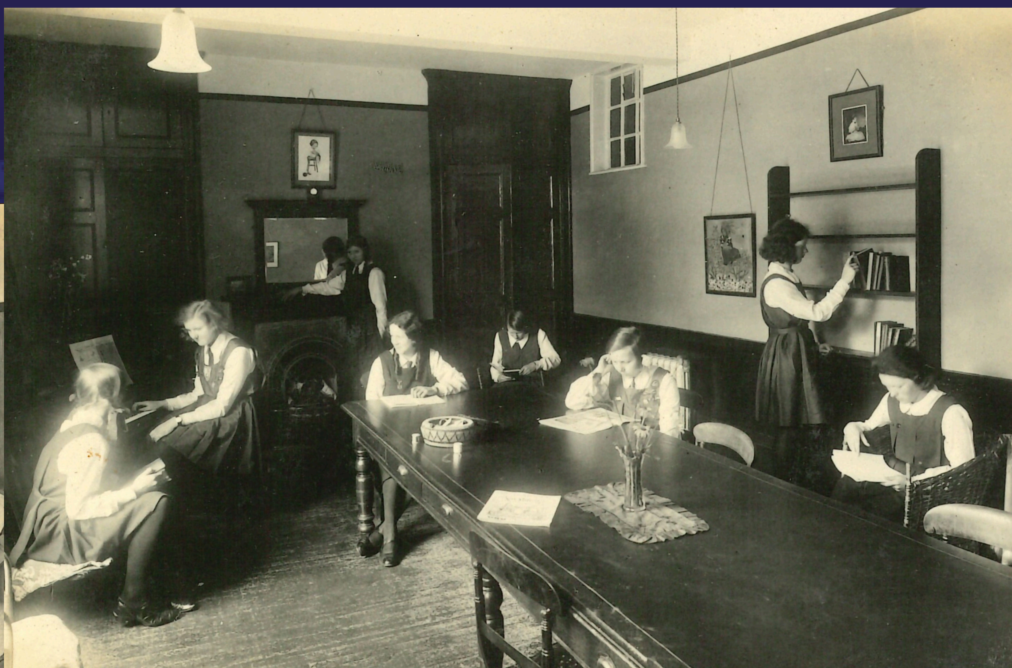
The Boarders' Study.