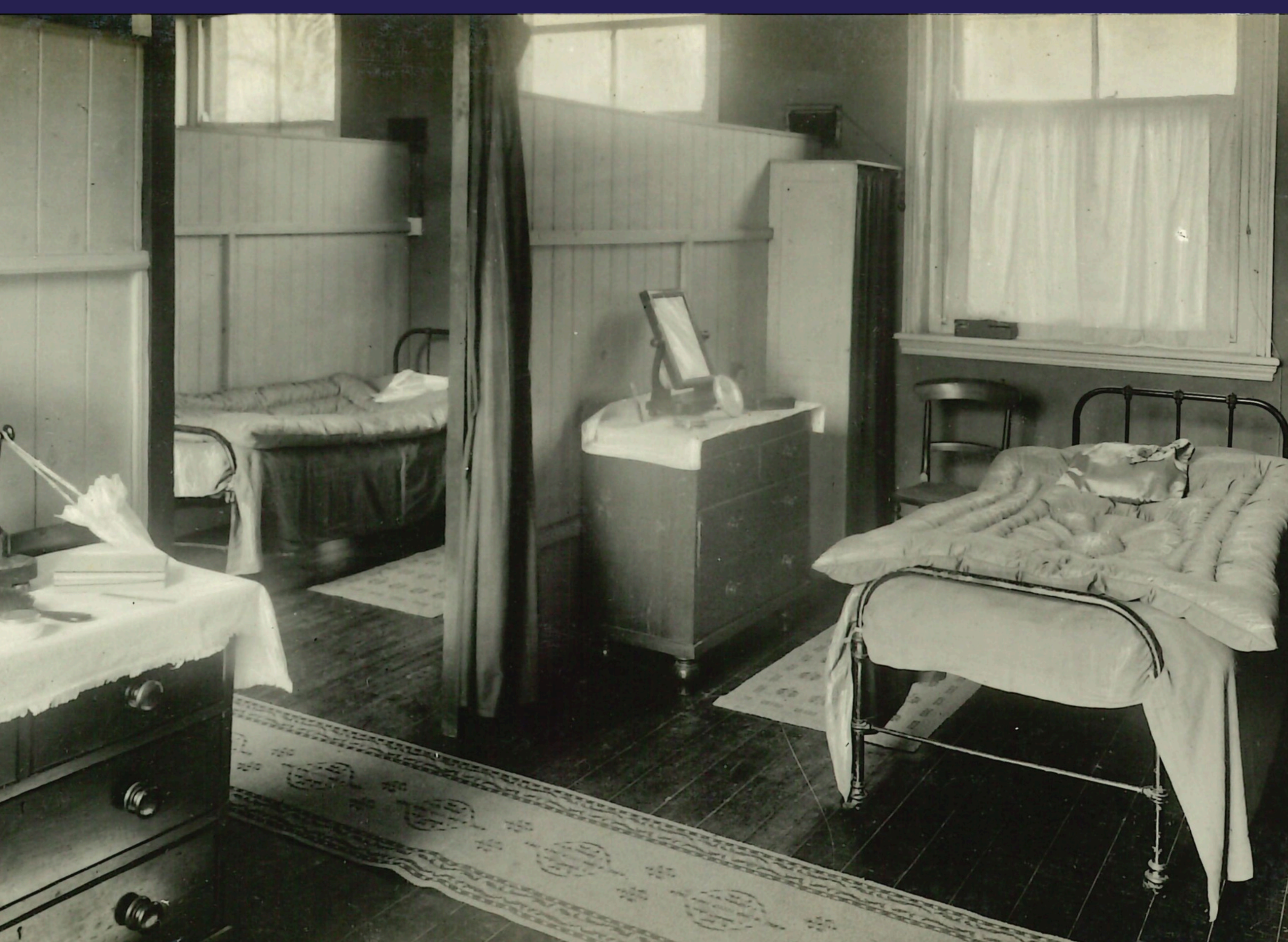
The Senior Dormitory in the attic space of the main school building.

I felt like, coming from my previous school where discipline was metered out in terms of physical punishments, Ockbrook School was not disciplined in that sense at all. It was all about learning to behave decently and well towards other people.