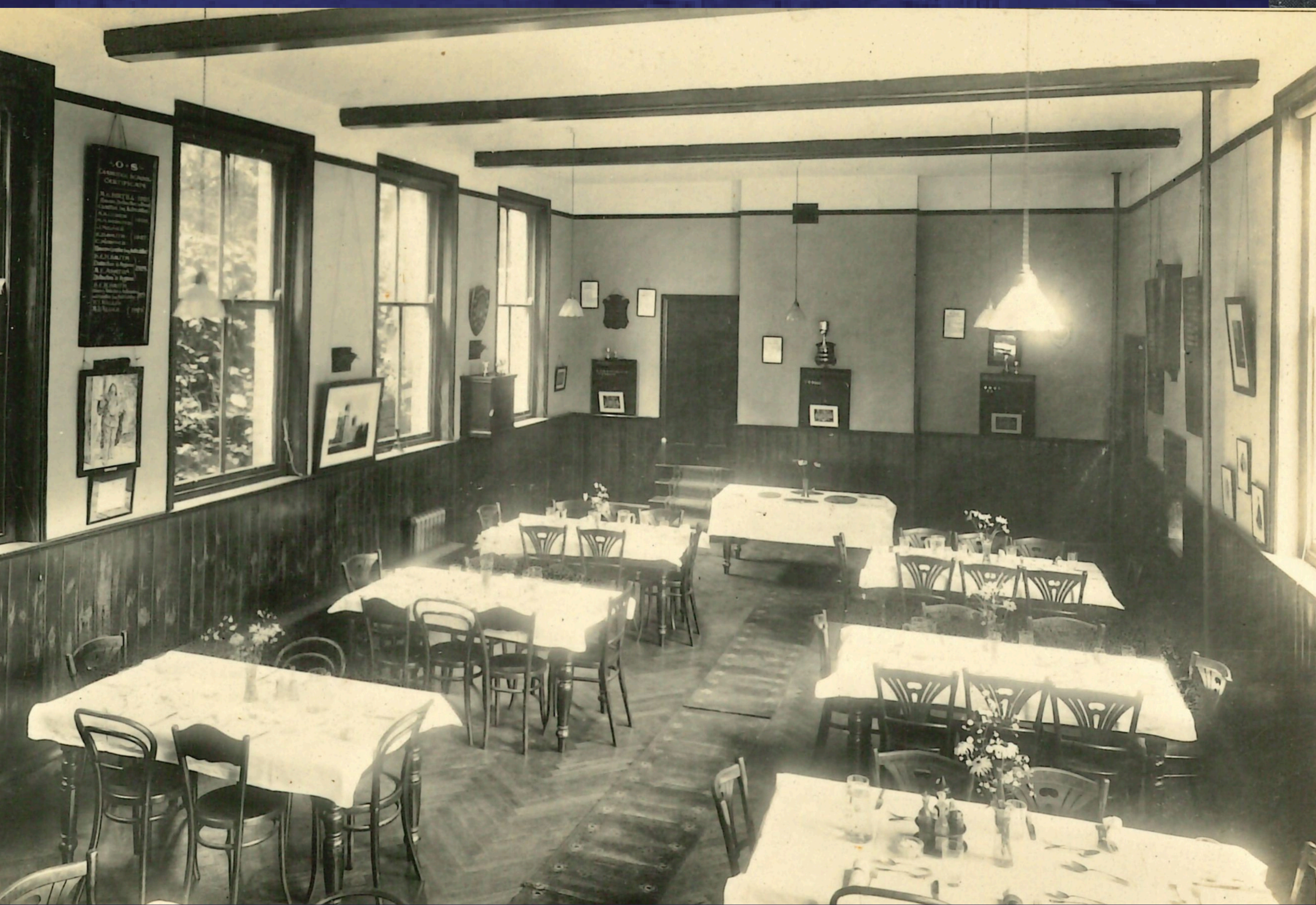
The Dining Hall in the 1930s.