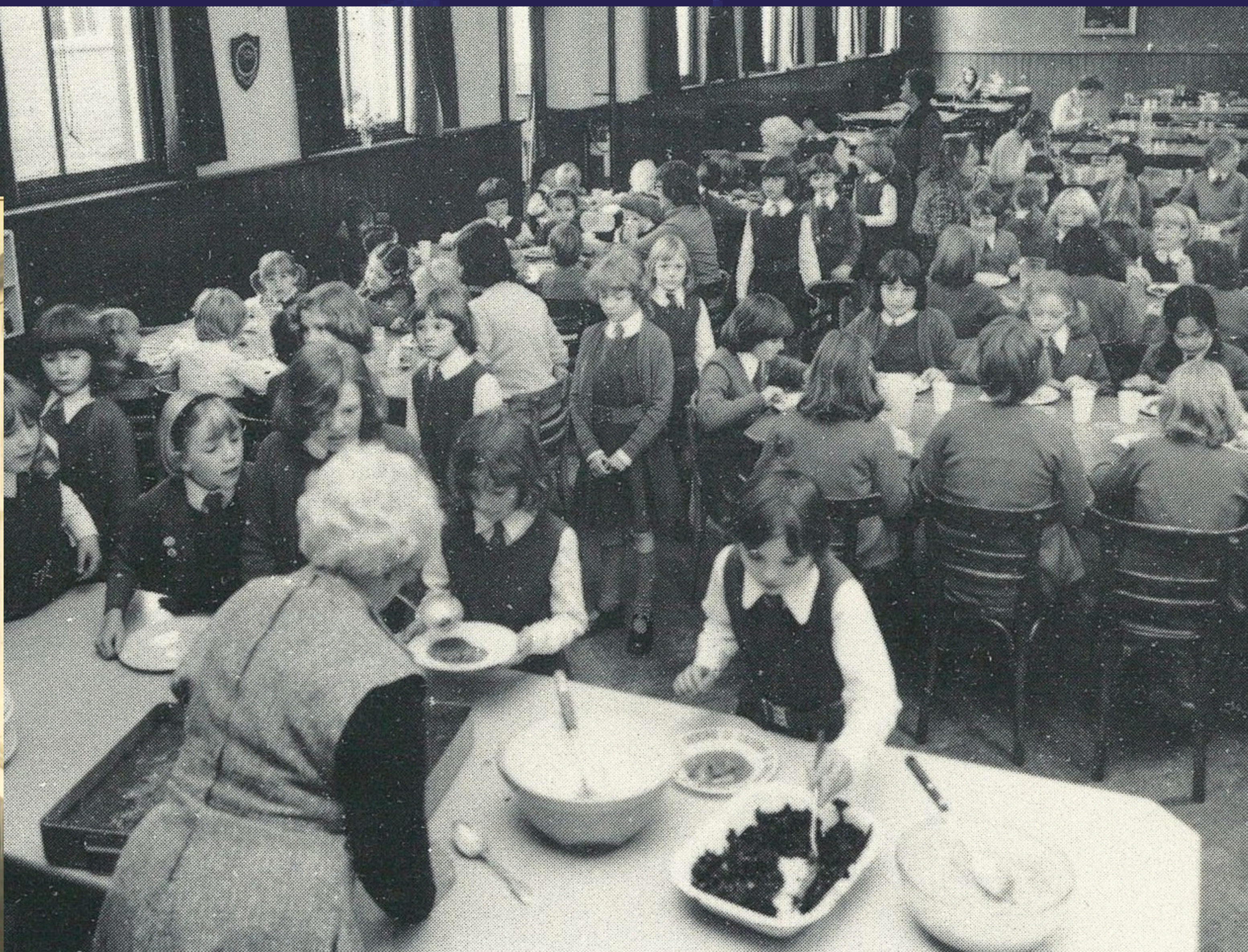
Lunch time during the 1980s.