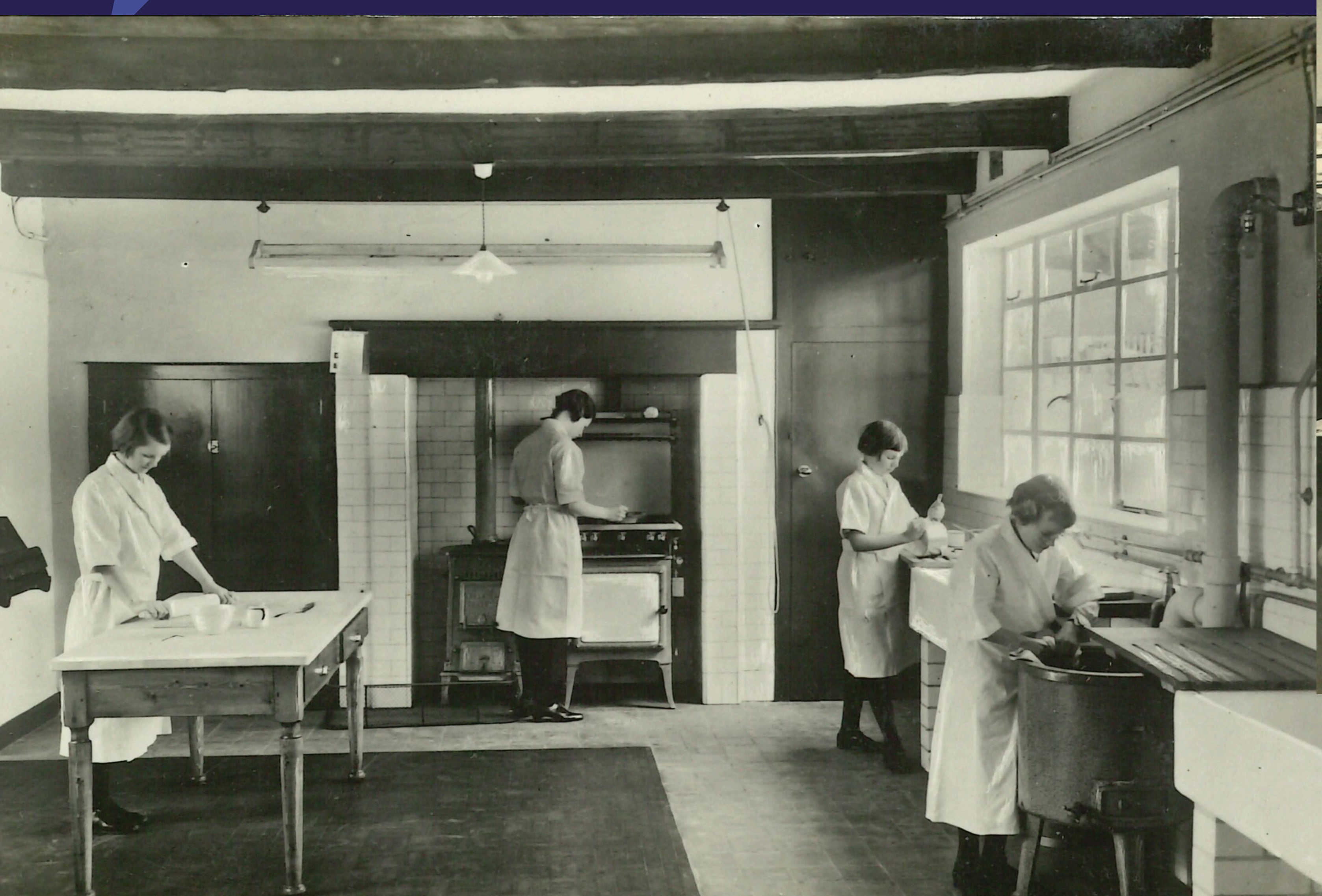
The House Craft Room. Later, this became the School Library.

I had the very best school days at Ockbrook School. Such a beautiful, happy place. There was a member of our family at the school from early 1900s to approximately 2017.