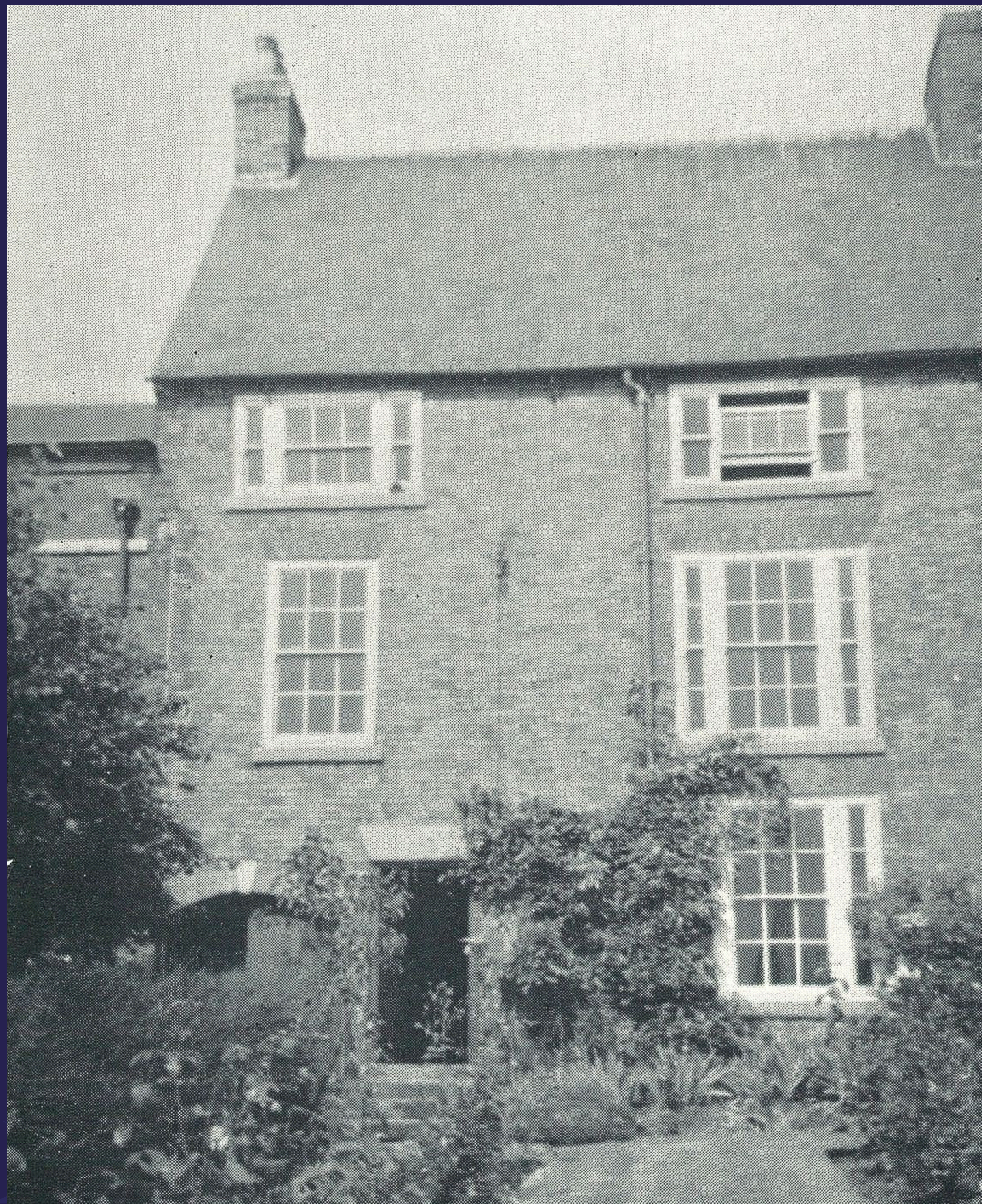
Rooms in Liley House were used by the school from 1803 until 1915.

Ockbrook School was founded by the Moravian church in 1799 as part of a settlement. The Moravian Church believed that all people, including girls should receive an education. The school started with just six pupils and one teacher in a house at No. 11 Shop Stones. It soon moved into buildings above the Church.