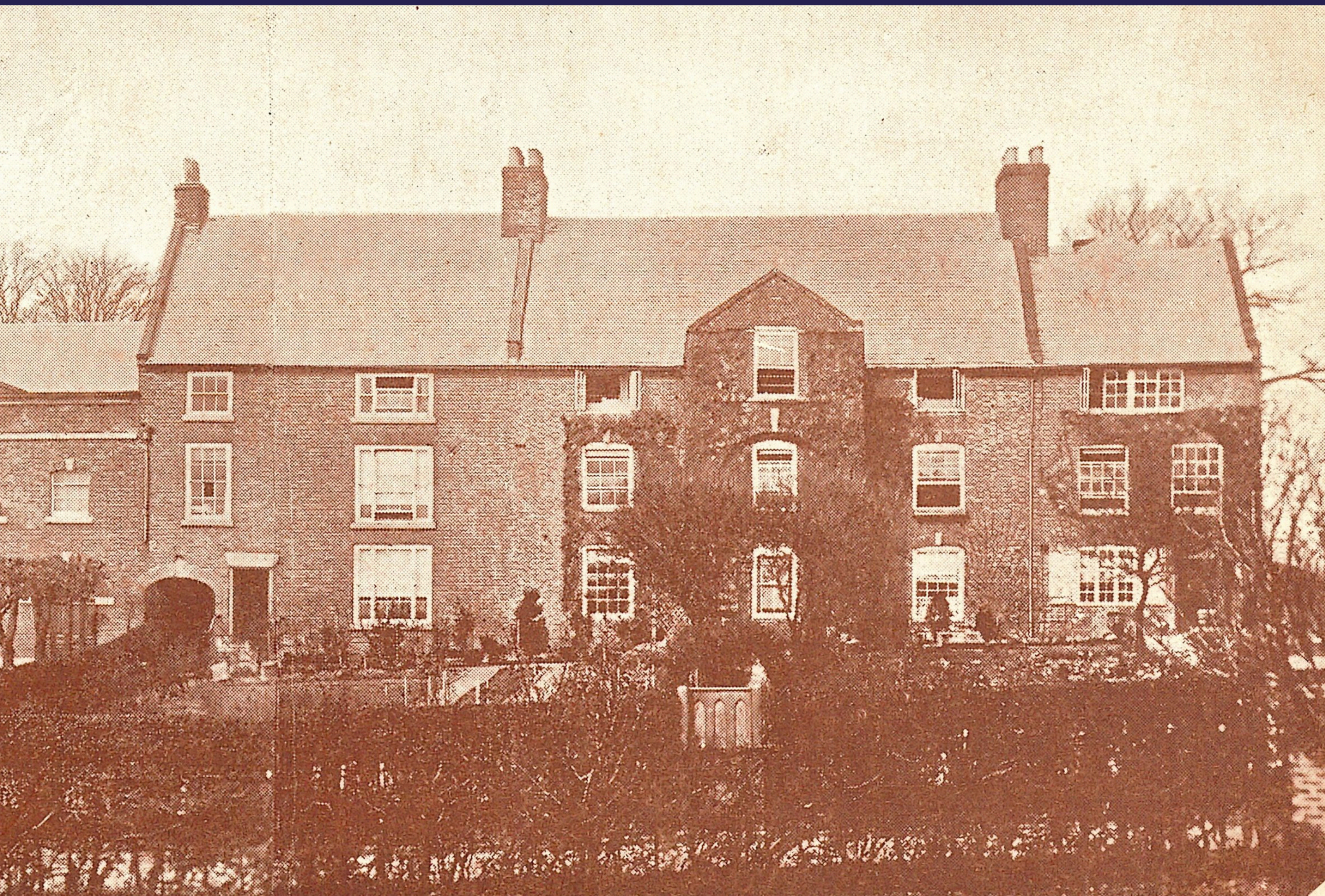
The Girls' School used rooms in the buildings above the Moravian Church before moving into the main school building in 1915, following the closure of the Boys' School.

We have a dedicated Heritage Officer, and created a Heritage Volunteer team to record and preserve the history of the site.