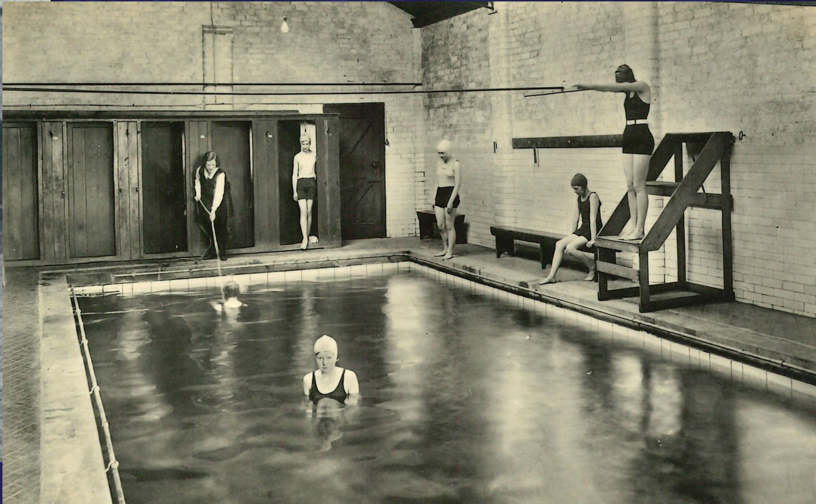
The Swimming Pool was allegedly one of the oldest heated indoor school pools in Britain. However, few former girls ever recall it being heated!