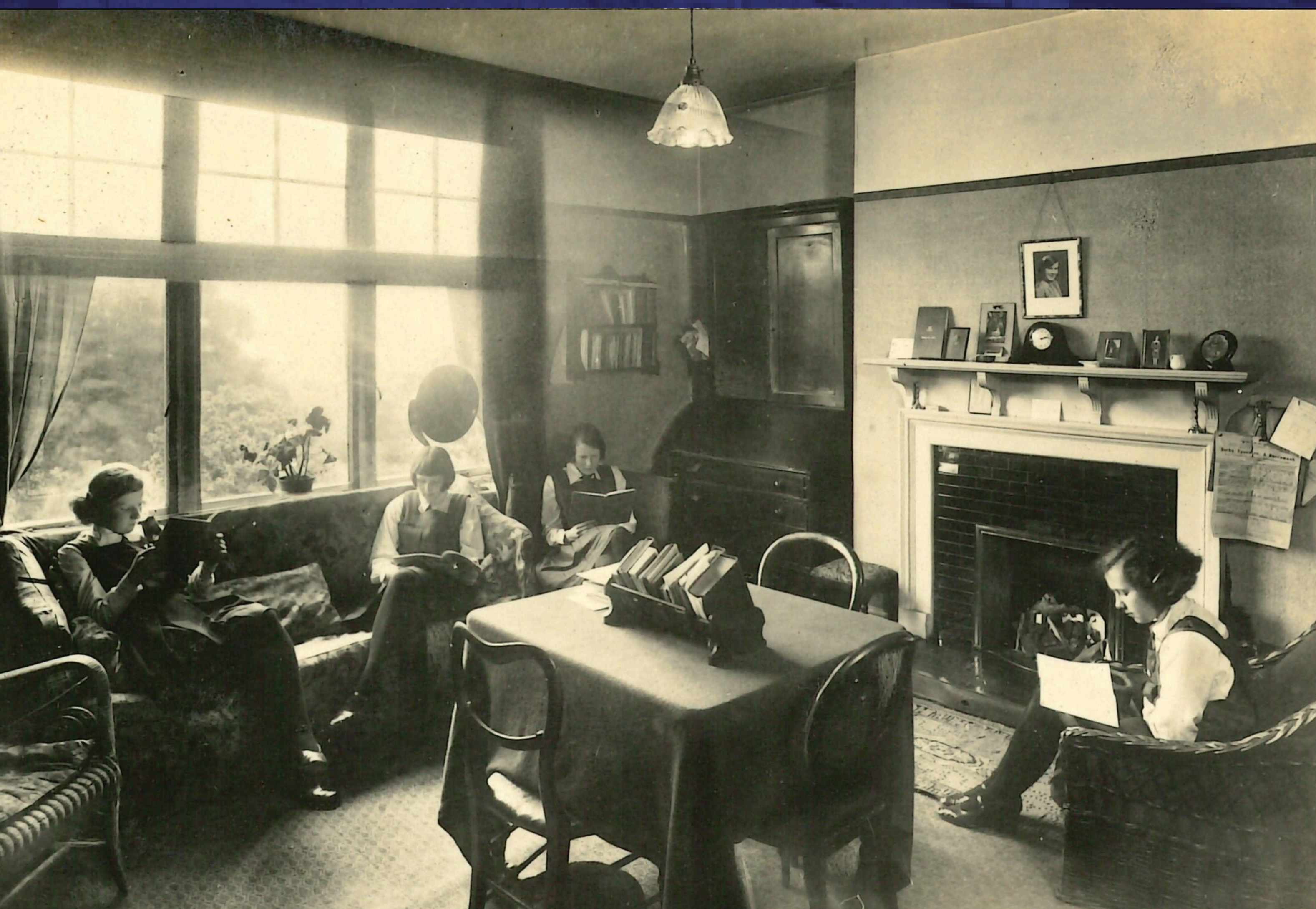
The Boarders' Sitting Room.