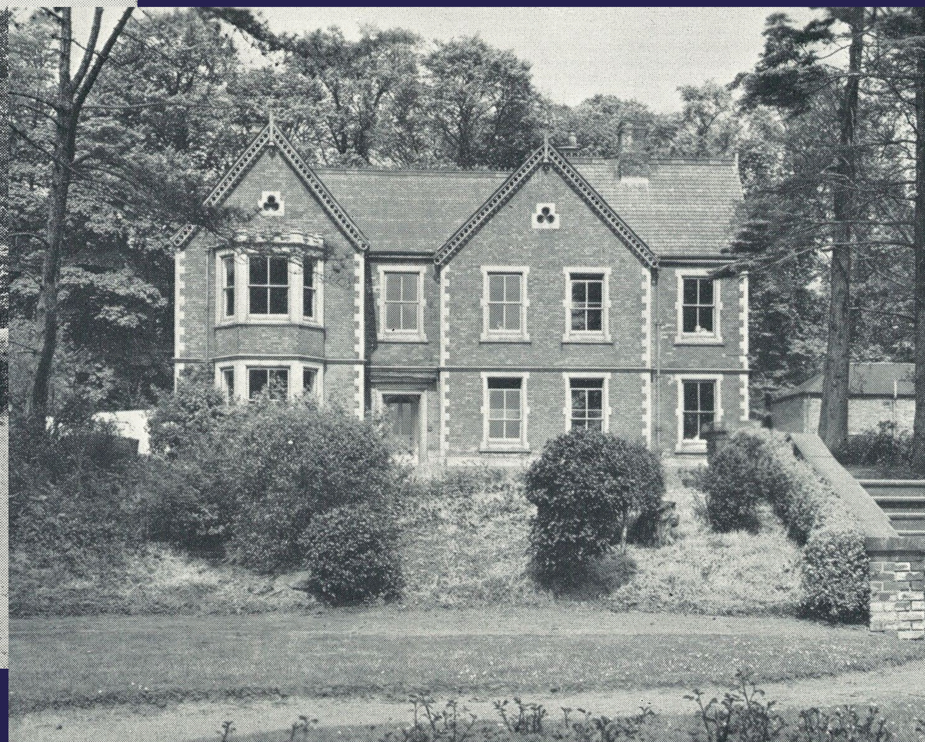
The Mount was purchased in 1948 to become the Junior Department.