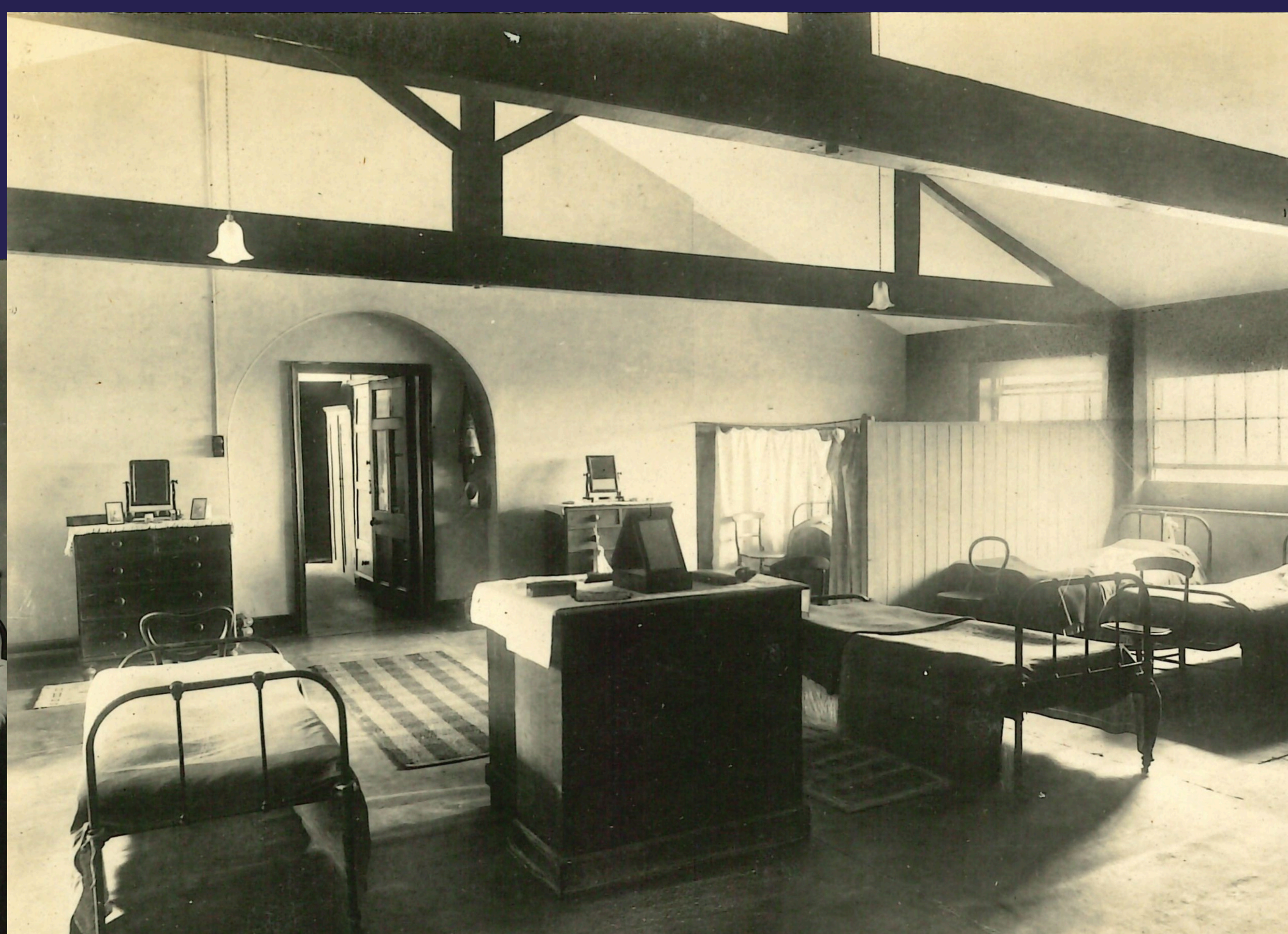
The Junior Dormitory on the top floor of the main building. This space was later converted into classrooms as the number of boarders declined.