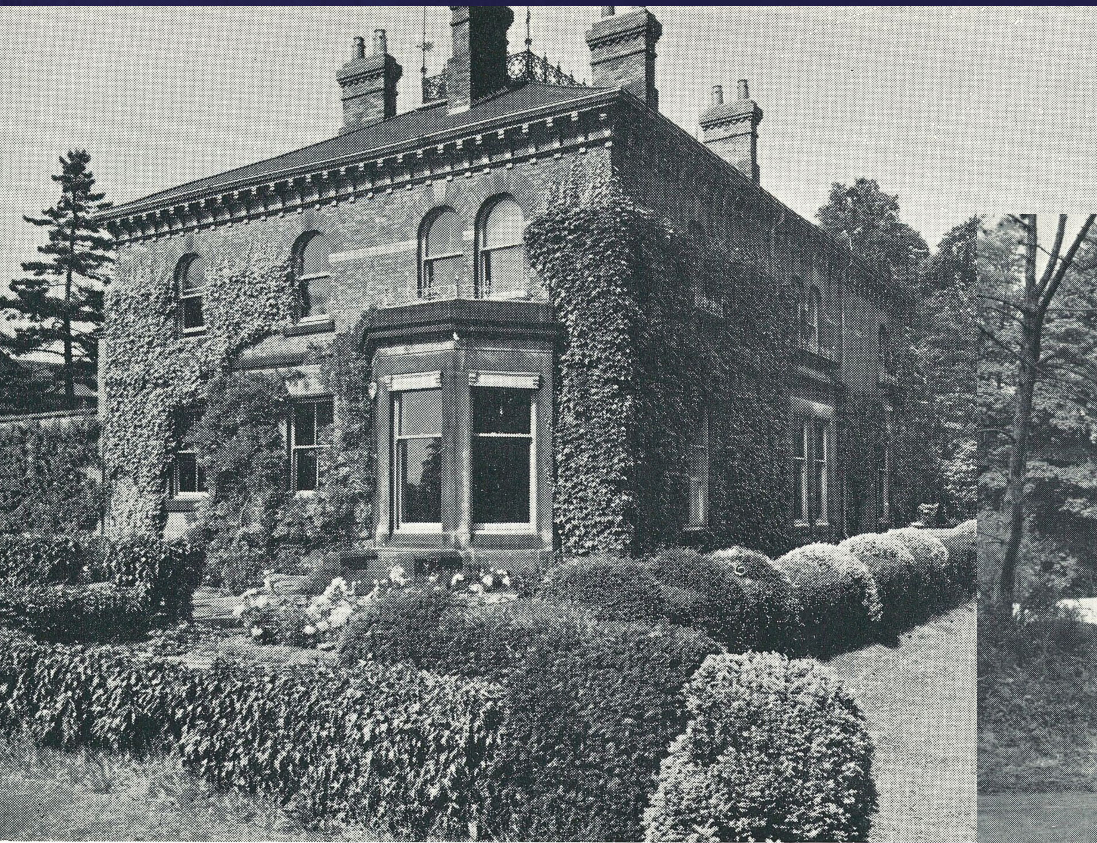
Originally named Swallows Rest, The Grange was built in the 1860s as a home for wealthy Moravian Minister William Mallalieu.

For its first hundred years, the school remained relatively small with a few dozen pupils. During the 20th century, pupil numbers increased. The school outgrew the main buildings and started using spaces in other buildings in the settlement. Two large houses, The Mount and The Grange, were purchased post-World War II to provide extra classrooms and boarding accommodation.