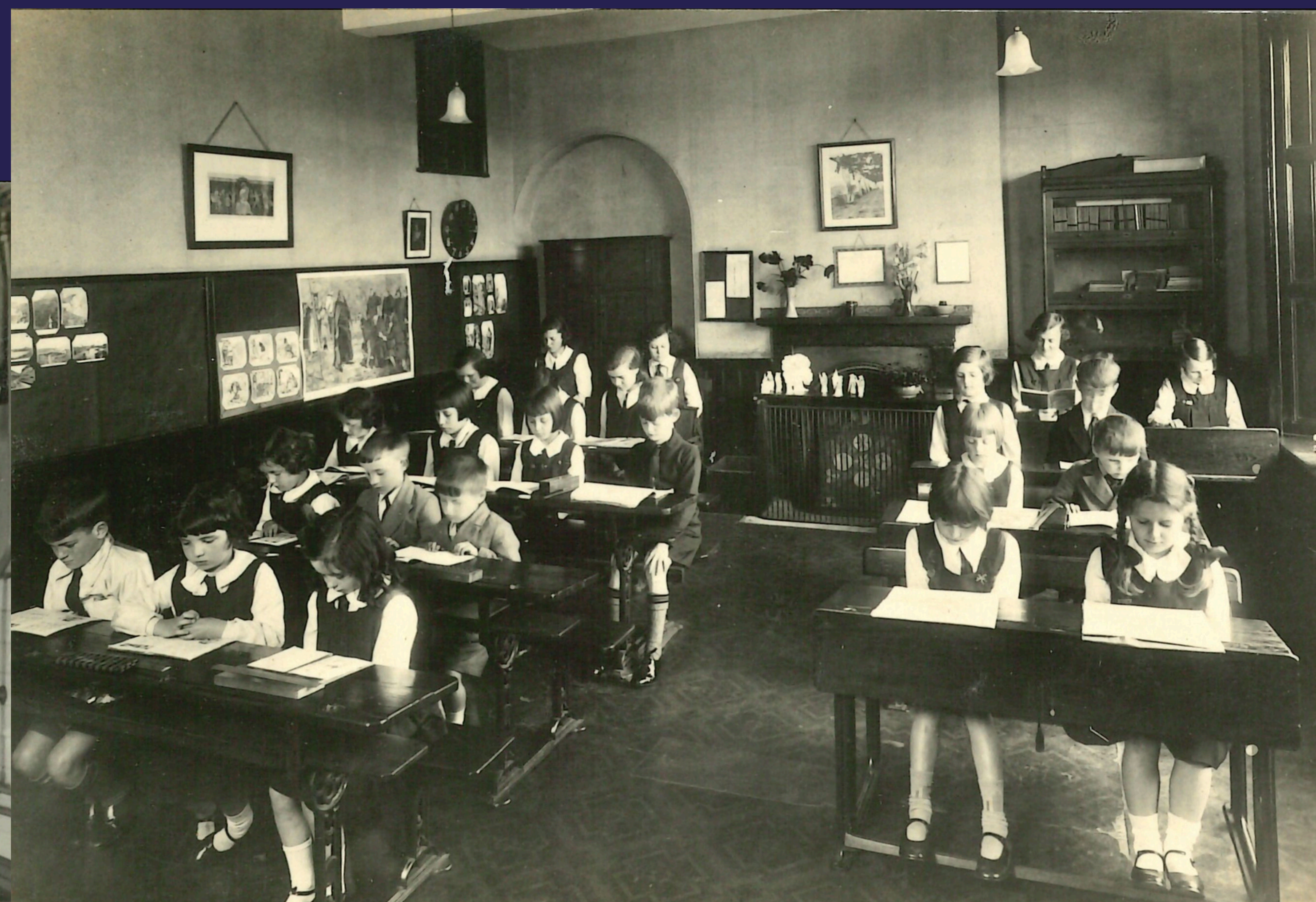
A 1930s classroom with victorian desks and bench seating.