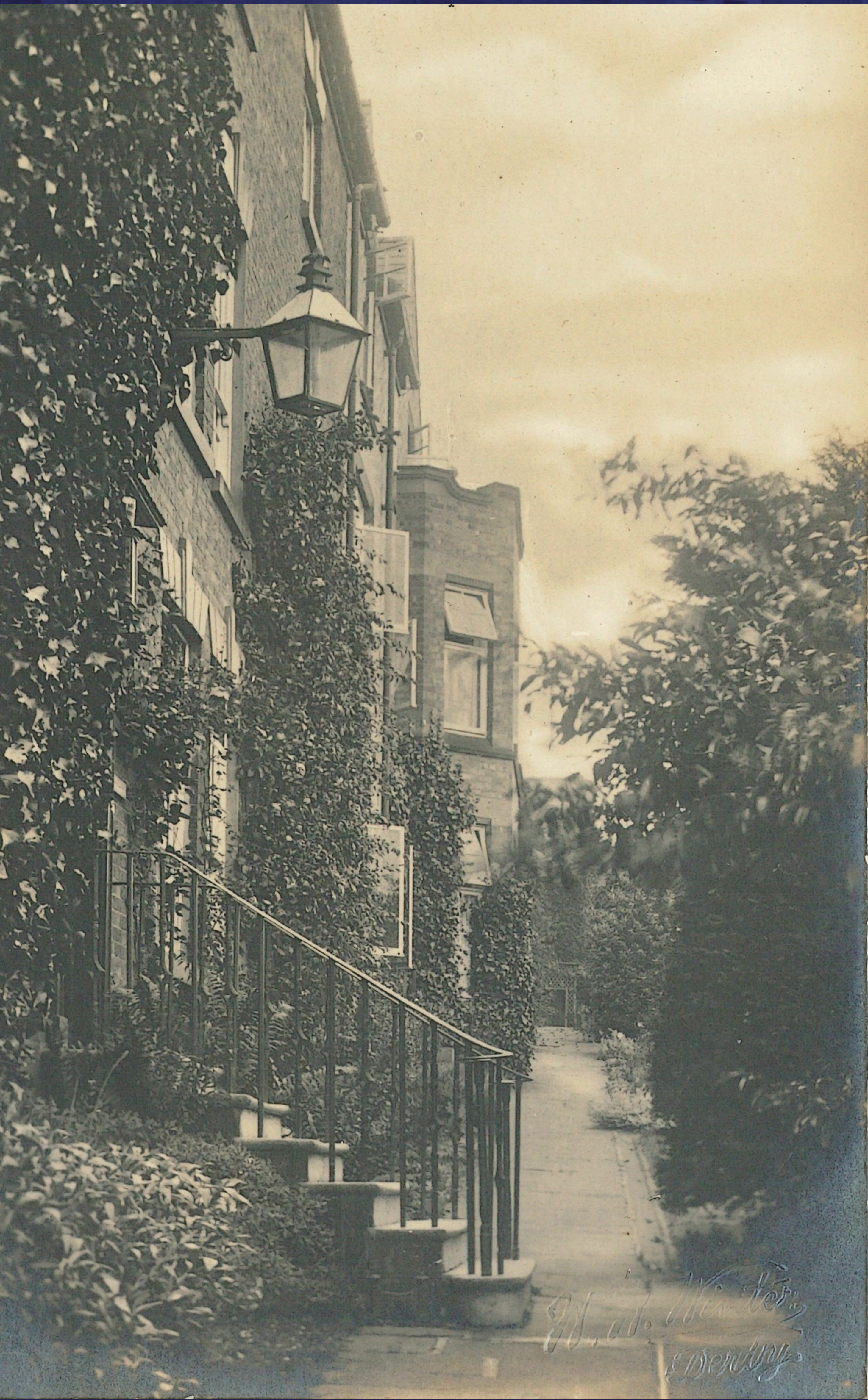
The Pupils' Entrance with its original lamp.

The historic buildings associated with the school today were originally part of Ockbrook Boys School. This was open from 1812 - 1915 and proved a 'troublesome neighbour' for the Girls' School.