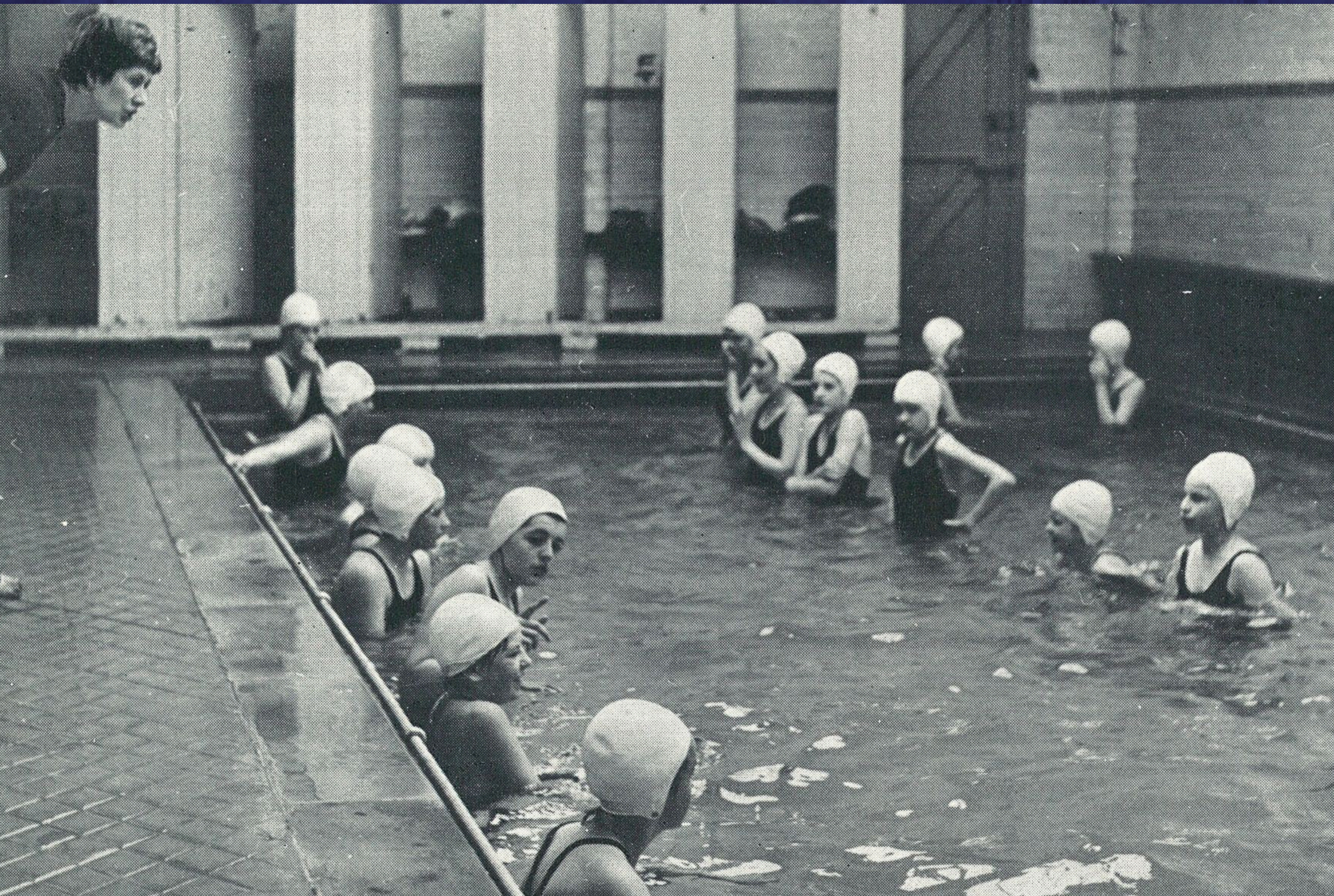
Swimming lessons in the 1980s.